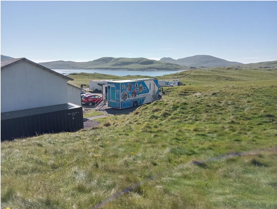
Figure 1 MSU at Vatersay Hall, Vatersay, Isle of Barra

of good practice which will be reflected in the 2022/23 Annual Quality Assurance Summary and will be available on the GMC dashboard.