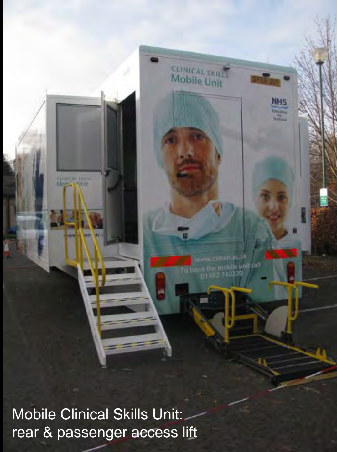
Mobile Clinical Skills Unit: rear & passenger access lift