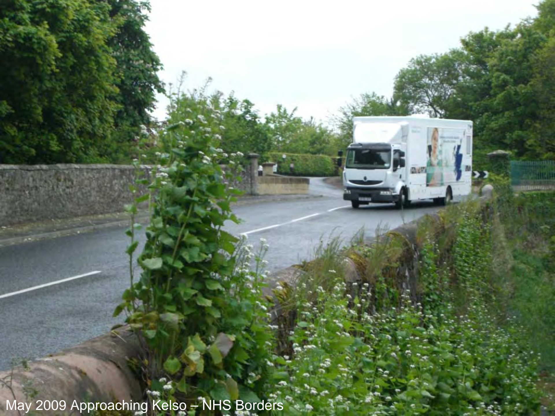
May 2009 Approaching Kelso – NHS Borders