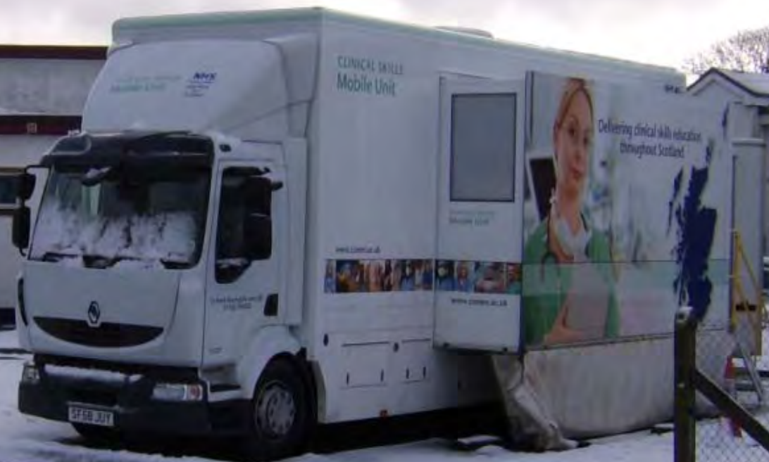
February 2009 at Wick – NHS Highland