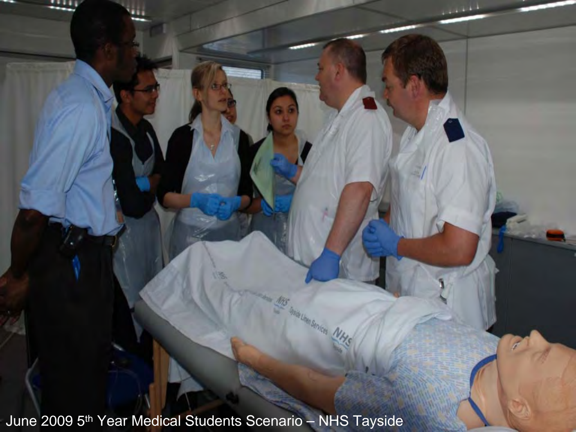
June 2009 5 th Year Medical Students Scenario – NHS Tayside