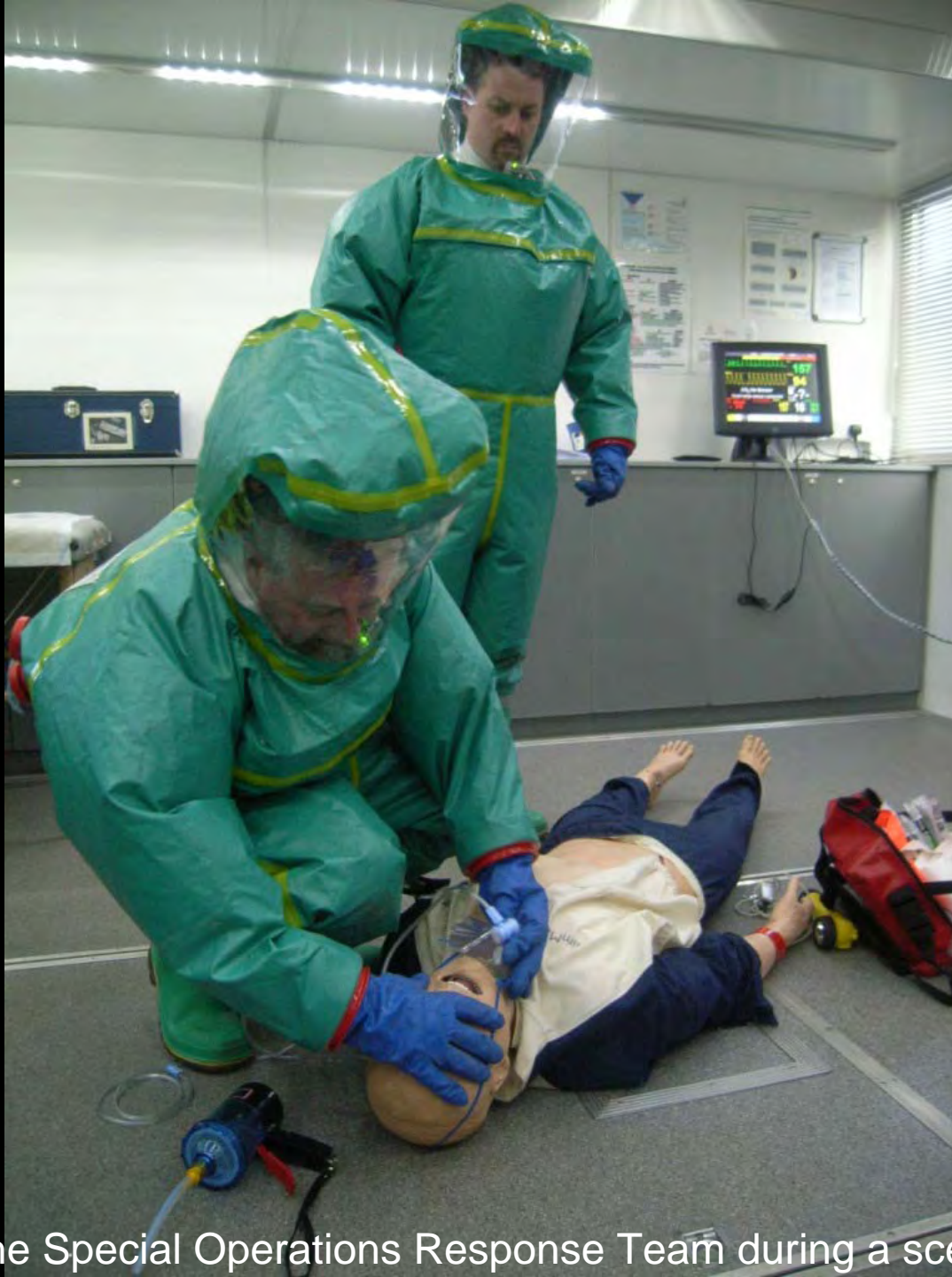
February 2010 – The Special Operations Response Team during a scenario