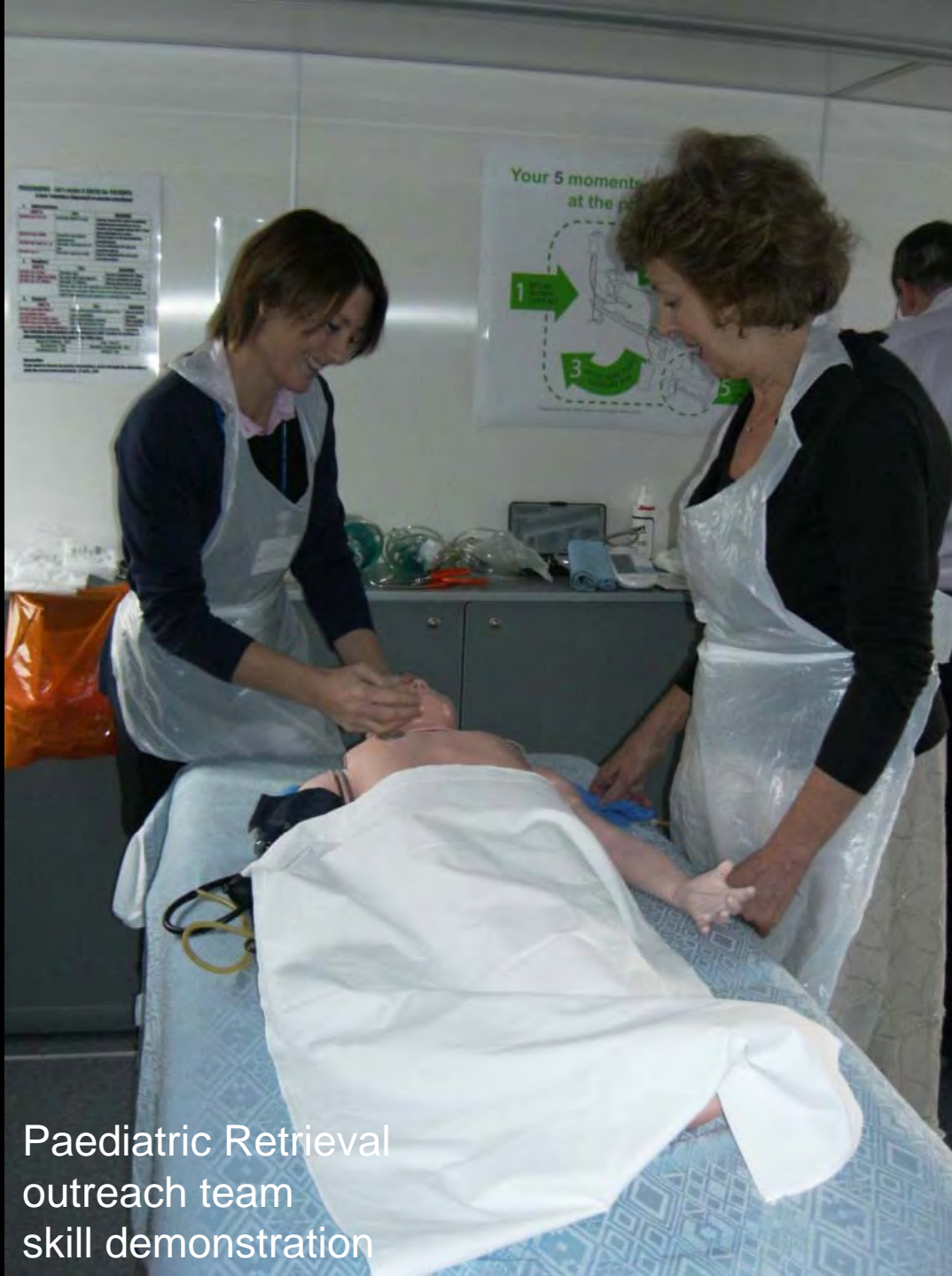
Paediatric Retrieval outreach team skill demonstration