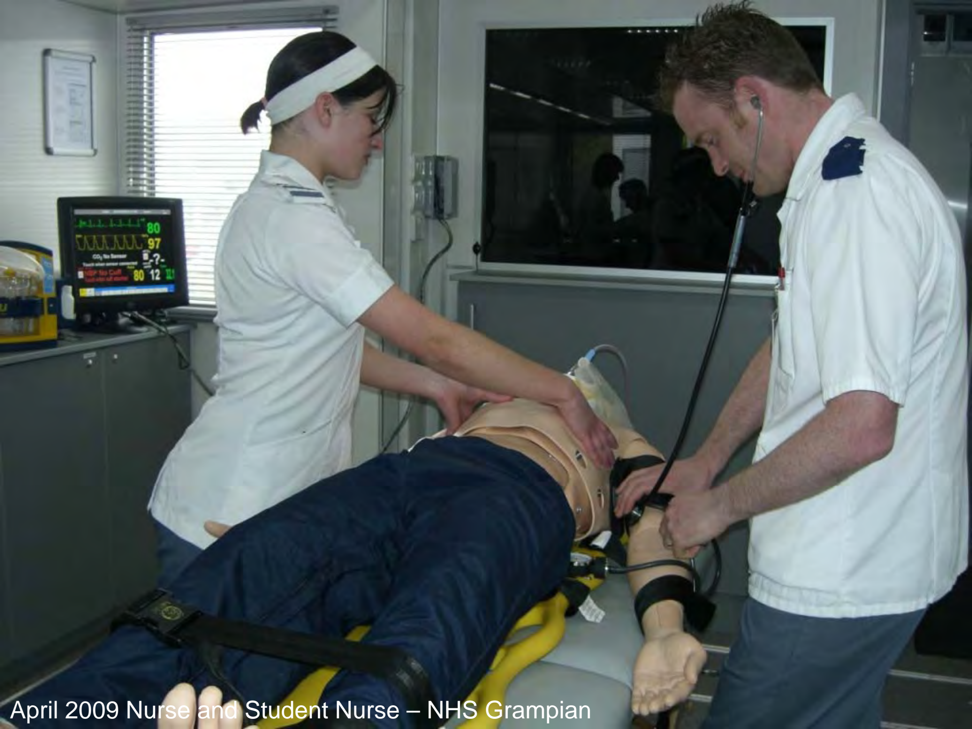
April 2009 Nurse and Student Nurse – NHS Grampian