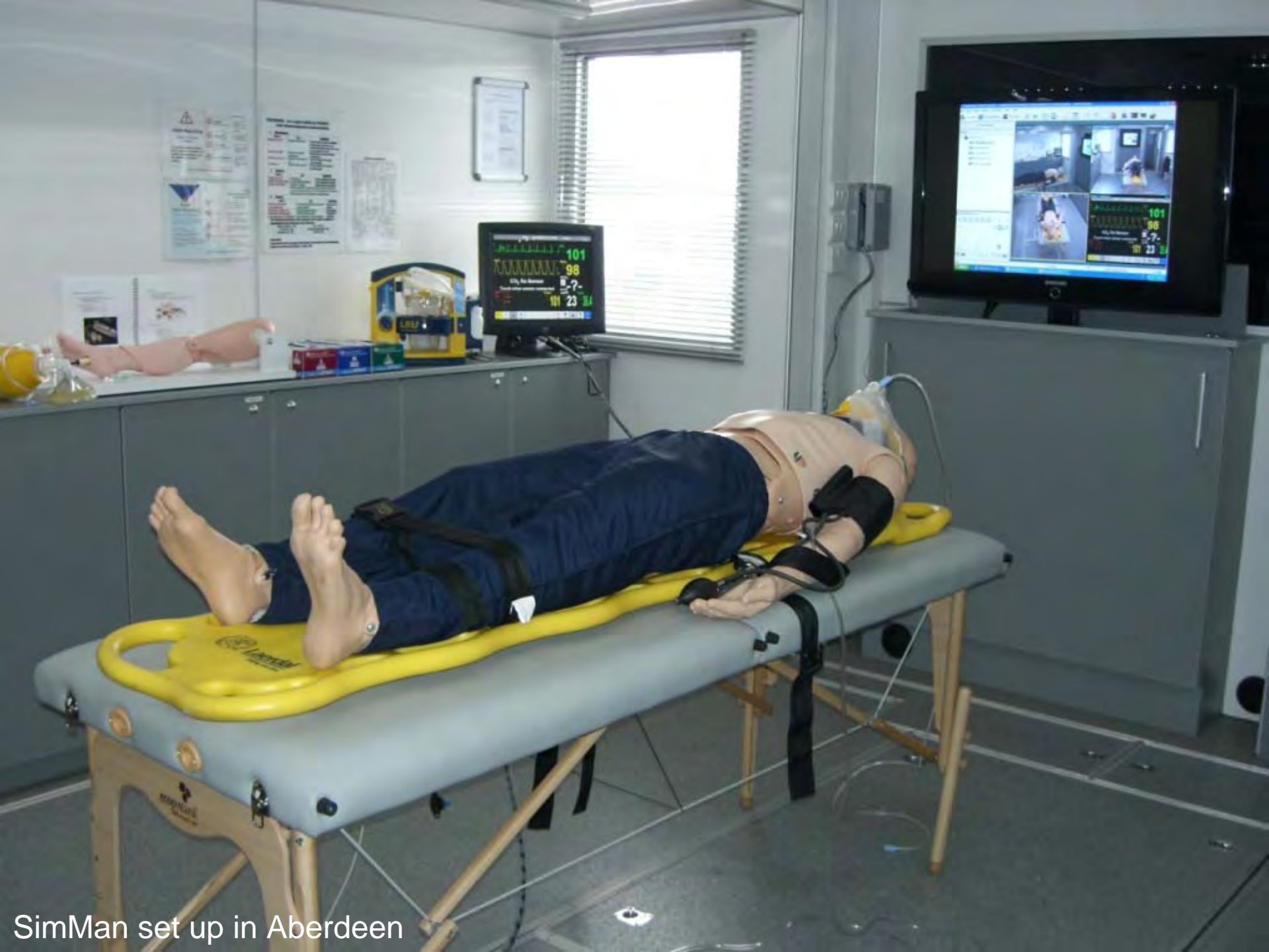
SimMan set up in Aberdeen