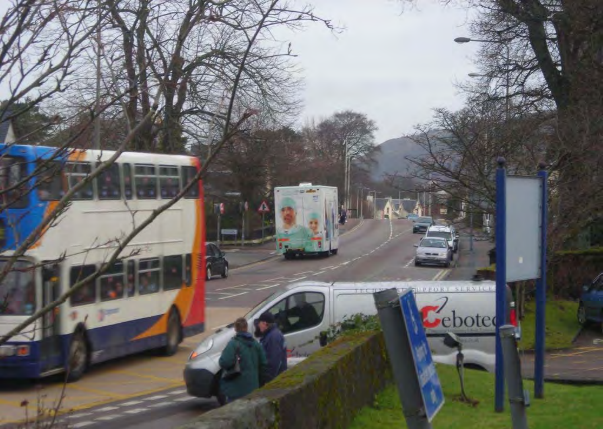
January 2009 Leaving the Belford Hospital, Fort William - NHS Highland