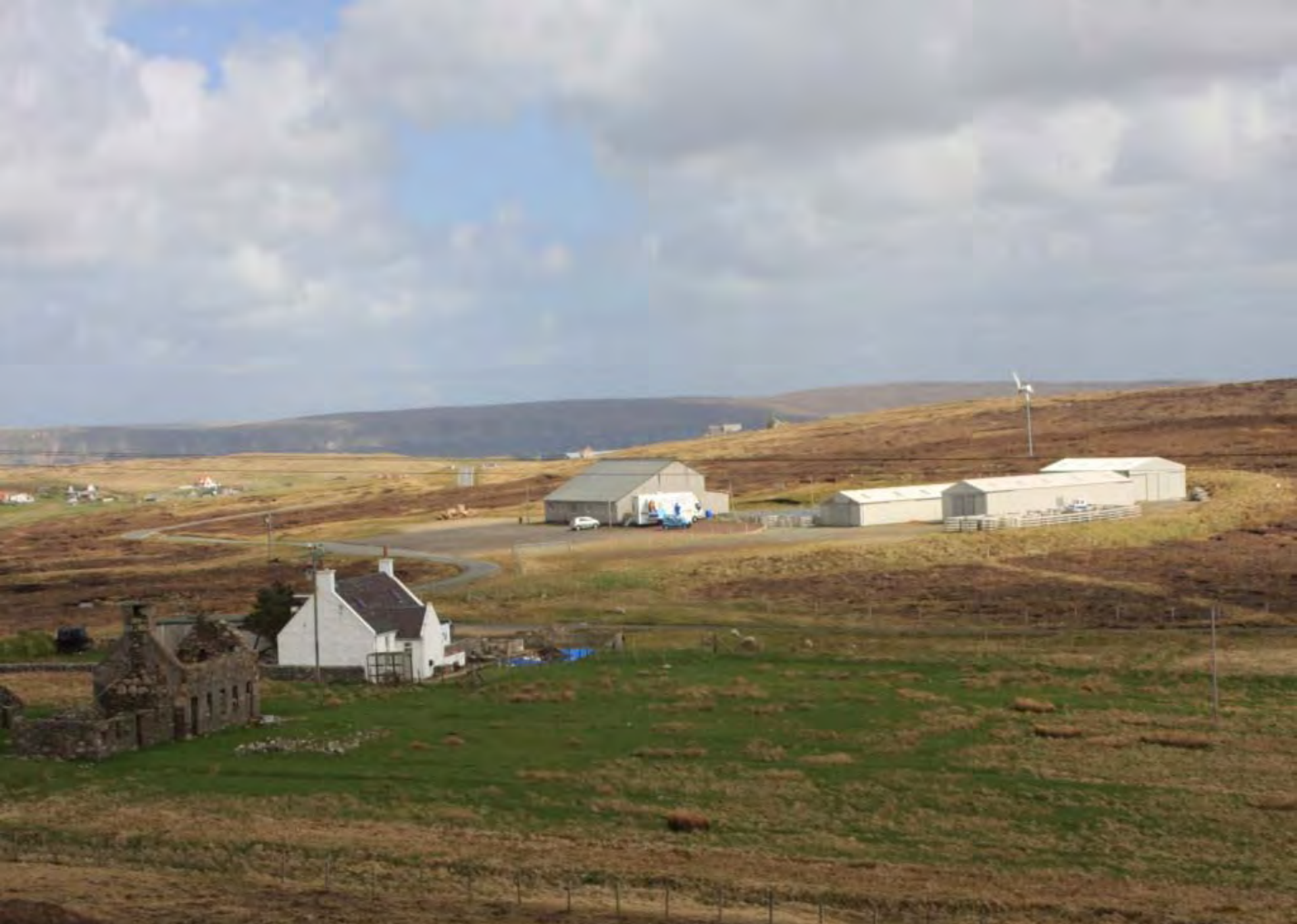
April 2009 at Yell Health Centre – NHS Shetland