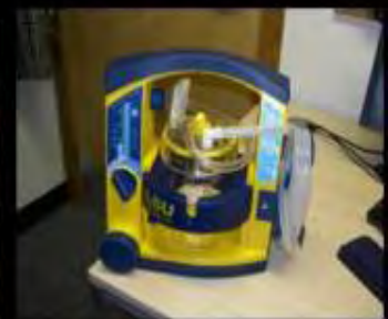
Some of the kit available on the Mobile Clinical Skills Unit