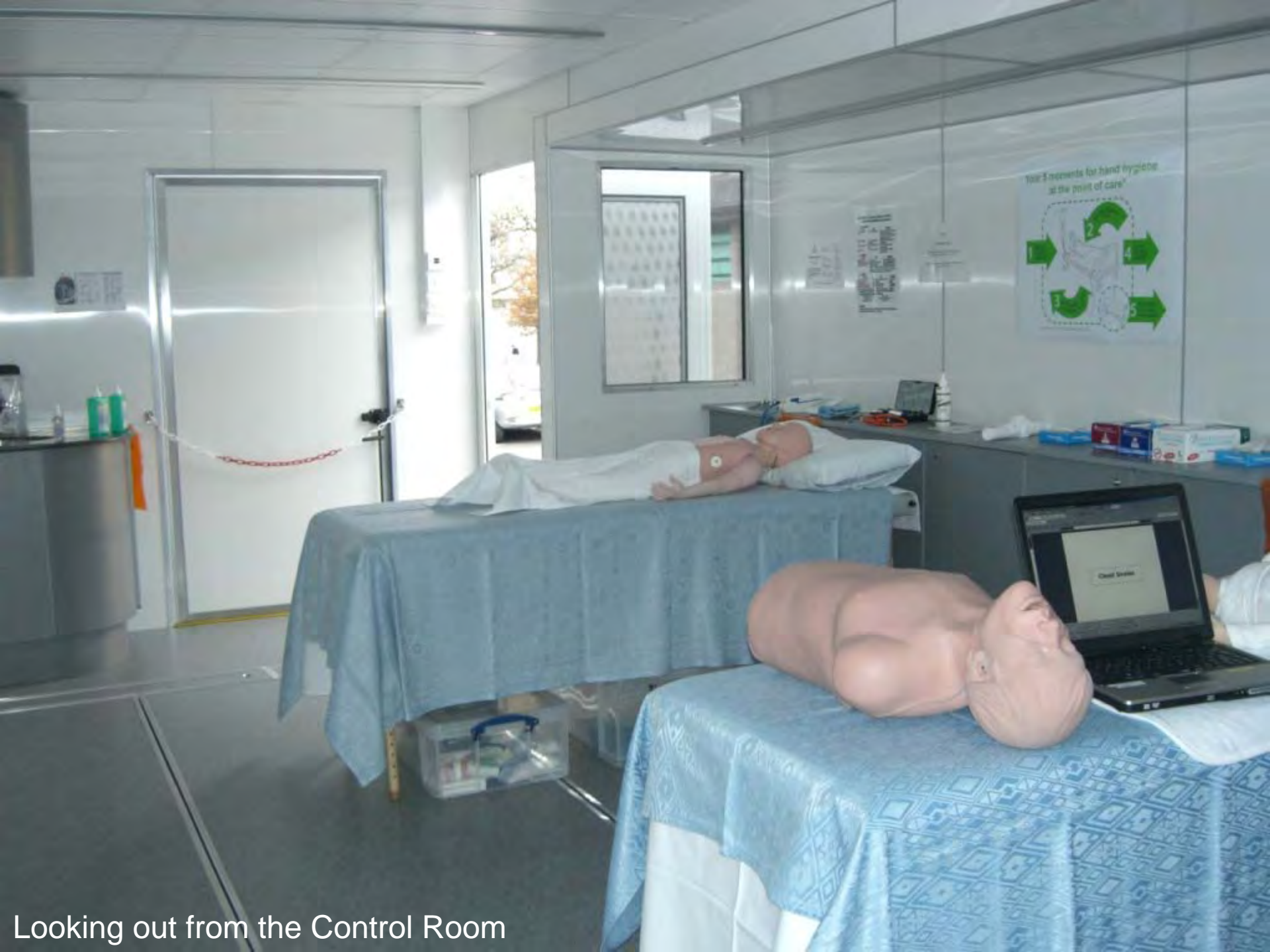
Looking out from the Control Room